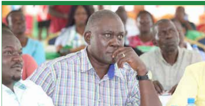
TOM MBOYA LABOUR COLLEGE, KISUMU

The Sacco carried out member education during the second quarter of the year. The areas covered were: Coastal region, Western region, Northern Kenya & Nairobi region. Through this we were able to educate over 2,620 members across the country.